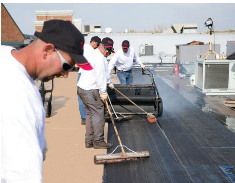
Hot mopped ply felts with an SBS Capsheet